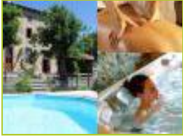
Table hosts and the guest rooms Chastanha

Trescouvieux 30760 Laval saint roman +33 (0)6 70 58 41 83